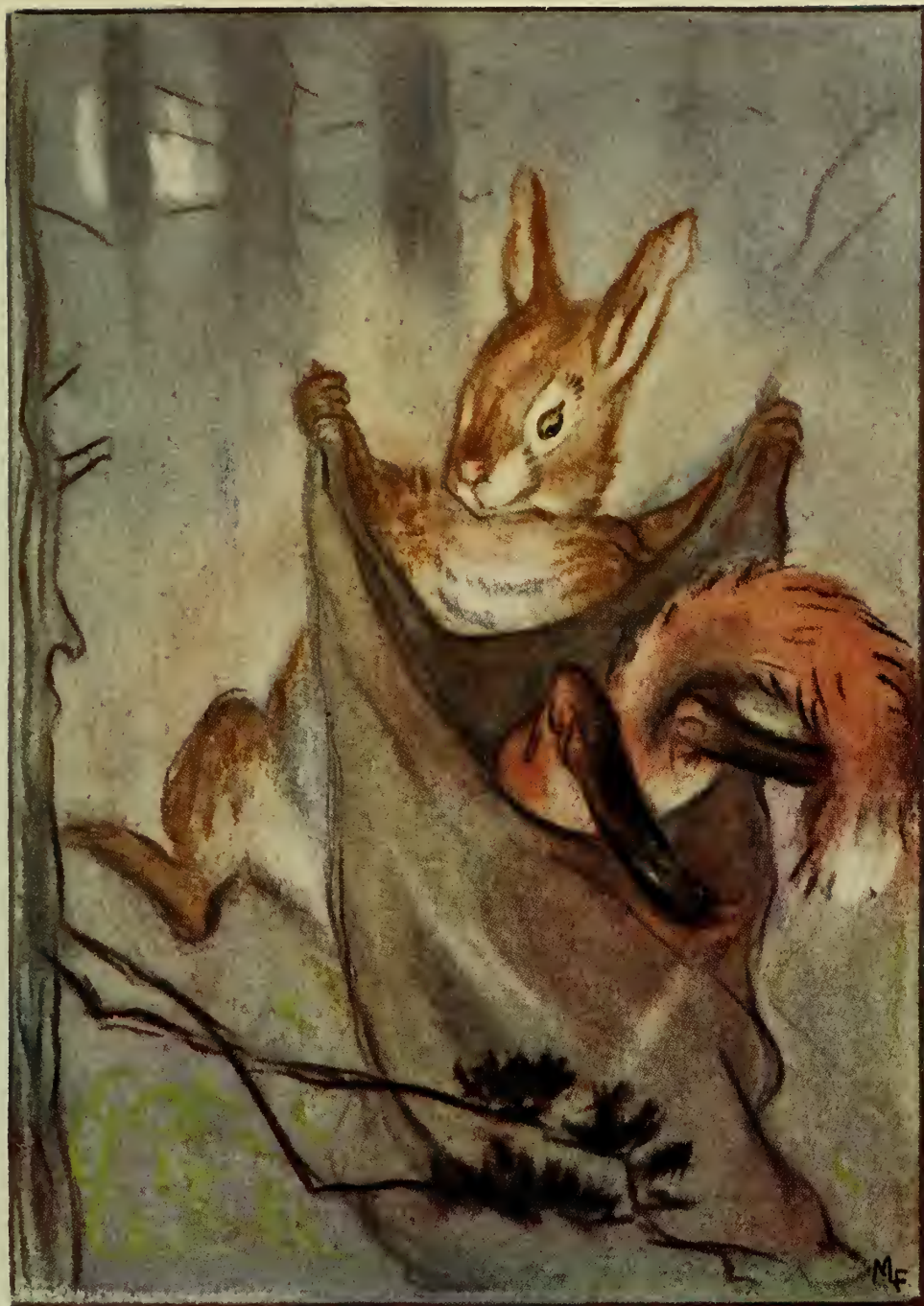
THEN FOX UNTIED THE BAG AND LET RABBIT OUT AND GOT INTO THE BAG HIMSELF